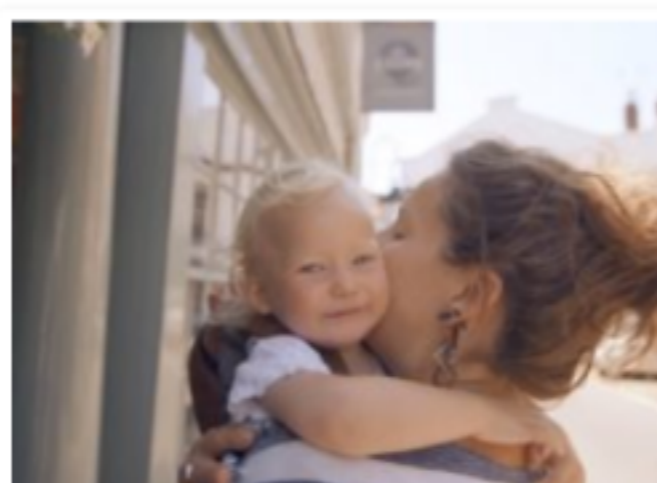
VIDEO: Explore Topsham this Sunday