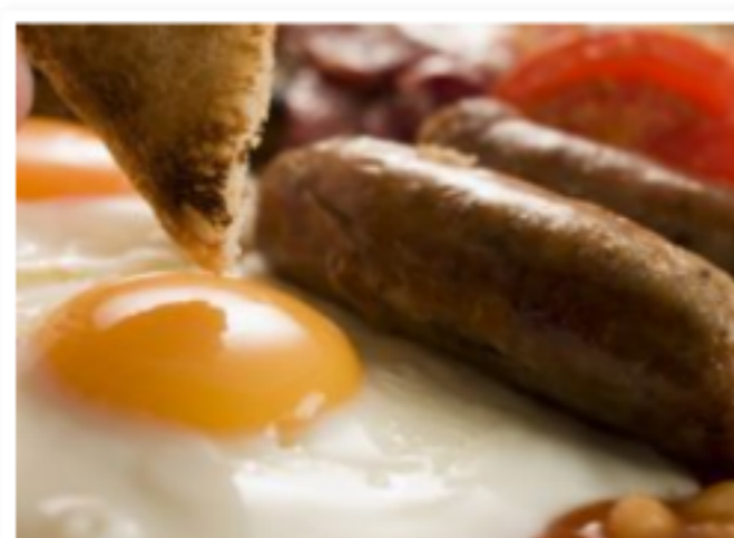
Scrummy Sundays – great places for brunch on the Avocet Line