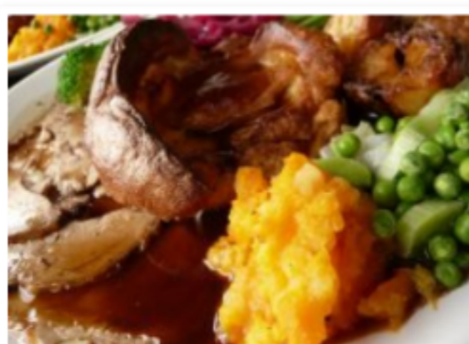
Five great Sunday roasts on the Avocet Line

Fares just £5.00 Adult Off-Peak Day Return (Exeter-Exmouth)