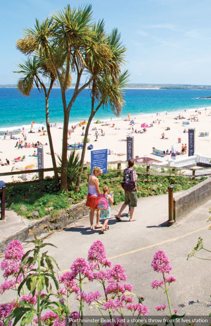
Porthminster Beach, just a stone's throw from St Ives station

Enjoy great views en route to some of Devon and Cornwall's best loved destinations – and forget the hassle of long-distance driving and traffic.